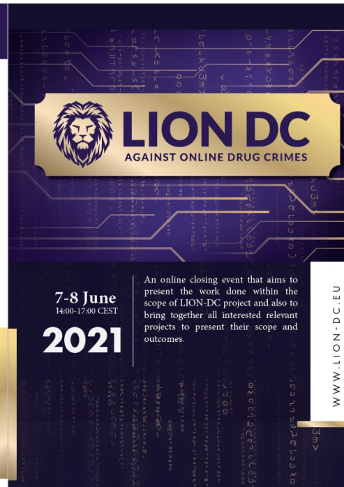
Figure 2: LION DC Closing Conference invitation

LION DC project is funded by the European Union's Internal Security Fund – Police, under grant agreement no 822616