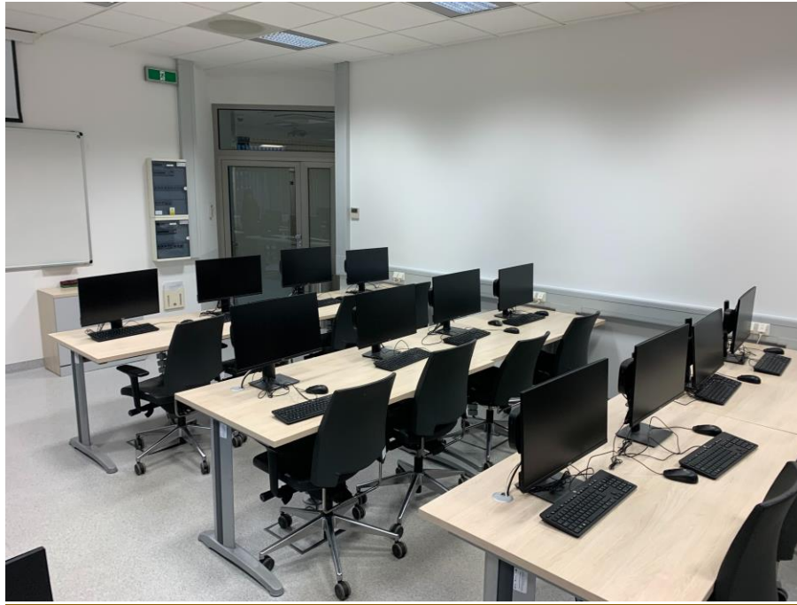
Figure I: LION DC Lab, Krakow

LION DC project organized a fruitful training took place on 12-14 February 2020 at the Faculty of Computer Science, Electronics and Telecommunication of the University of Science and Technology in Krakow, Poland. The training was dedicated to the fight against online drug crimes and aimed mainly at team leaders and representatives of the European cybercrime divisions. Over 20 experts were trained in OSINT tools, using the platform which is created for the EU funded project's purposes. Various topics were covered such as Dark Web OSINT, Dark Markets, Cryptocurrencies, Crypto Wallets etc, from theoretical to practical/hand-on domains.