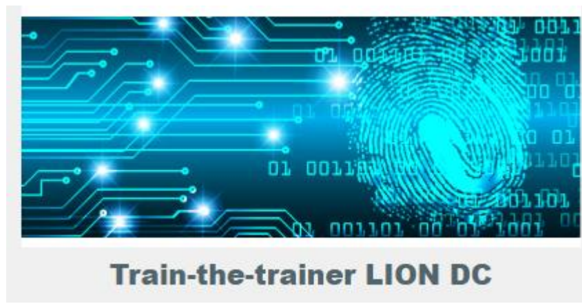
Figure 2: Train-the-Trainer course Moodle logo